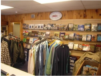
Getting ready for the Fall in the library.

Another topic we discussed was how UpCountry can be competitive with the Big Box Stores. Grady wasted no time suggesting they can not only help you select the right equipment to meet your skill level but show you how to