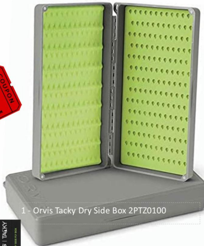
1 - Orvis Tacky Dry Side Box 2PTZ0100