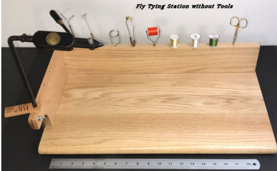
Fly Tying Station without Tools