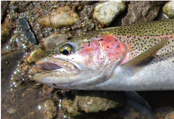
The Bomber Strikes Again!

You need to try this pattern! Tie them in other colors (yellow, green, olive, gray, etc.) and sizes. One time I was using the original color (orange rusty color), struck too soon and pulled it out of the fish's mouth but didn't nip it. Made a couple of casts over the missed fish only to turn away when it got a better look at the trout with success. Went back down to the fish I spooked, changed to a yellow bodied Bomber and on the second cast landed the biggest of the day... a 19 inch Bow!