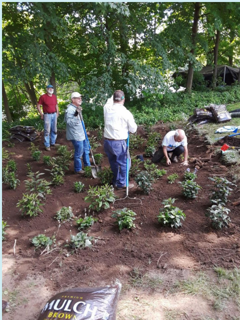
Rain garden installation at the Bozrah Town Hall