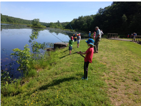
Audubon Society Day Camp fishing class