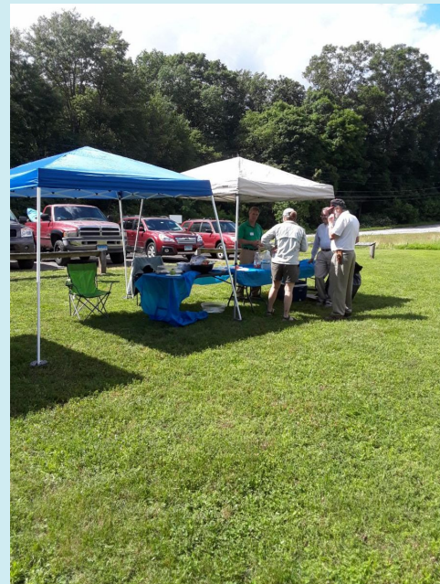
The Last Green Valley Floating Workshop fly tying and fly casting demonstration