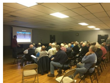
Nice turn out at our new meeting location.

BWO later in the year although being introduced to the Hex Hatch for the first time I have to include that hatch / Shetucket River - heavily stocked with trout in the spring and salmon in the fall