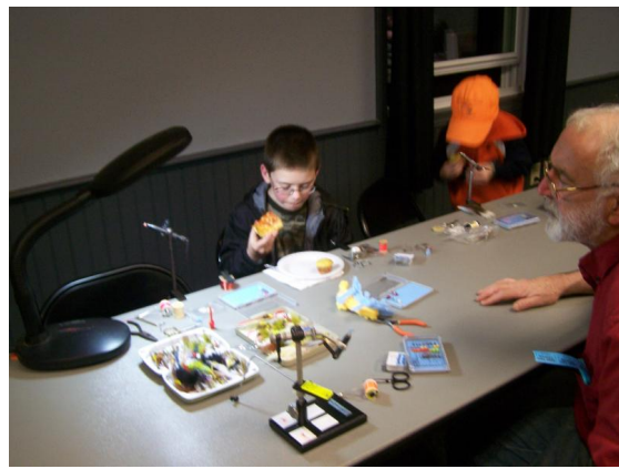
Flies and pizza; doesn't get any better!