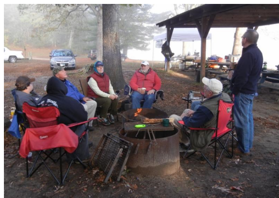
After breakfast huddle by the fire